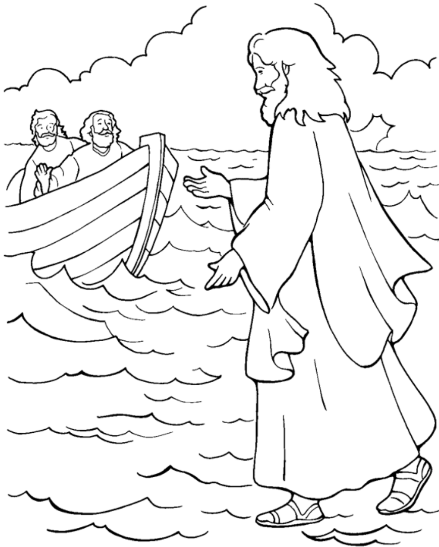
Jesus Walks on Water

From Thru-the-Bible Coloring Pages for Ages 4-8. © 1986, 1988 Standard Publishing. Used by permission. Reproducible Coloring Books may be purchased from Standard Publishing, www.standardpub.com, 1-800-543-1301.