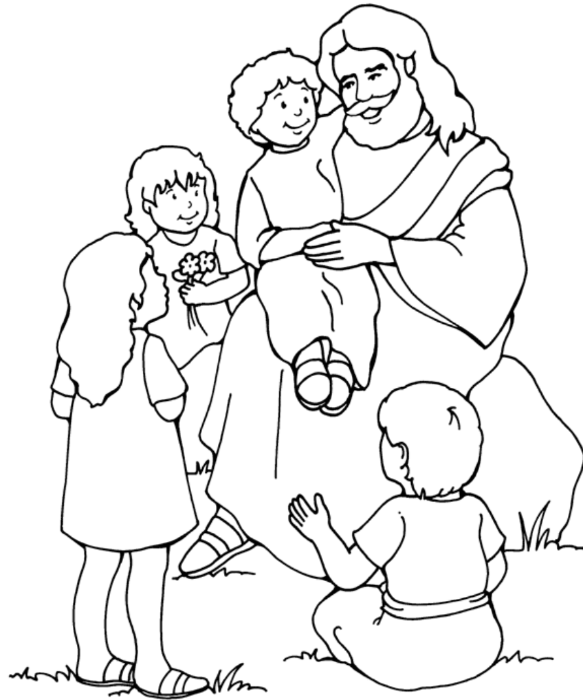
Jesus and the Children

Each number represents a letter of the alphabet. Substitute the correct letter for the numbers to reveal the coded words.