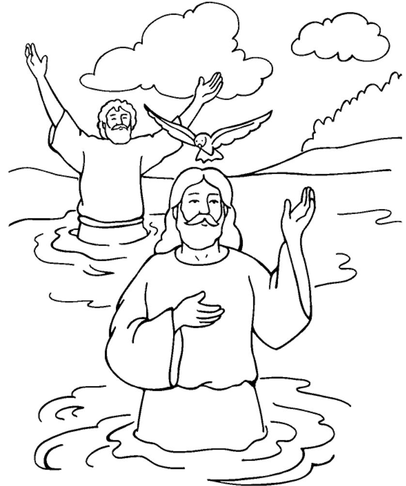
John Baptizes Jesus Matthew 3, Mark 1, Luke 3