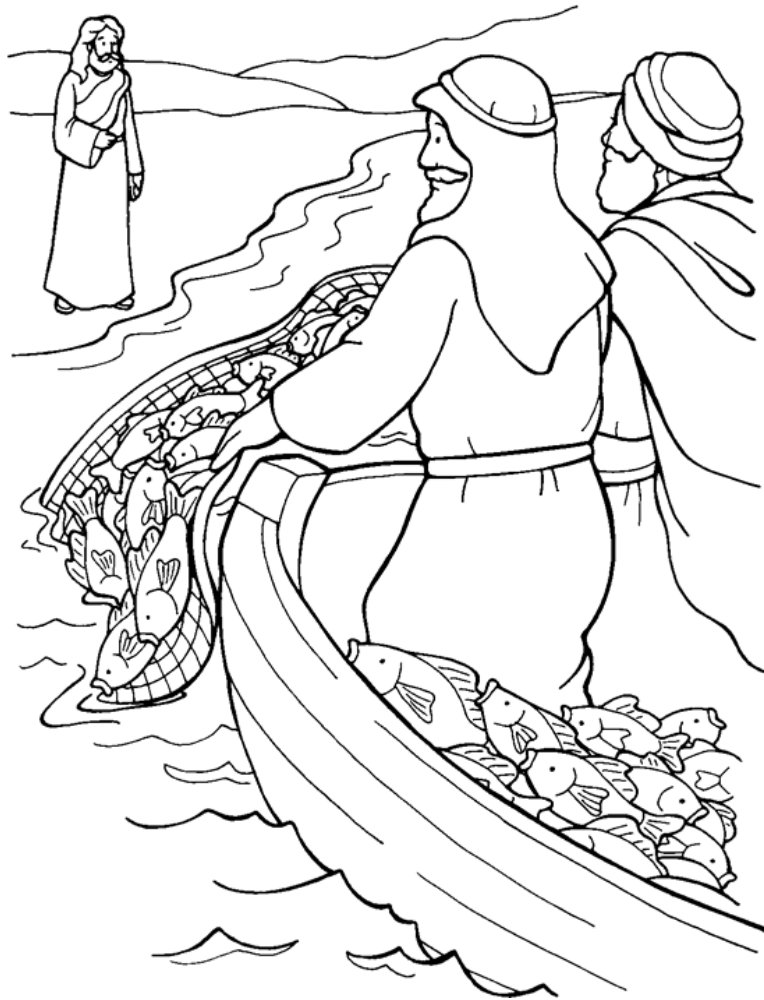
Jesus calls four of his disciples.

From Thru-the-Bible Coloring Pages for Ages 4-8. © 1986,1988 Standard Publishing. Used by permission. Reproducible Coloring Books may be purchased from Standard Publishing, www.standardpub.com , 1-800-543-1301.