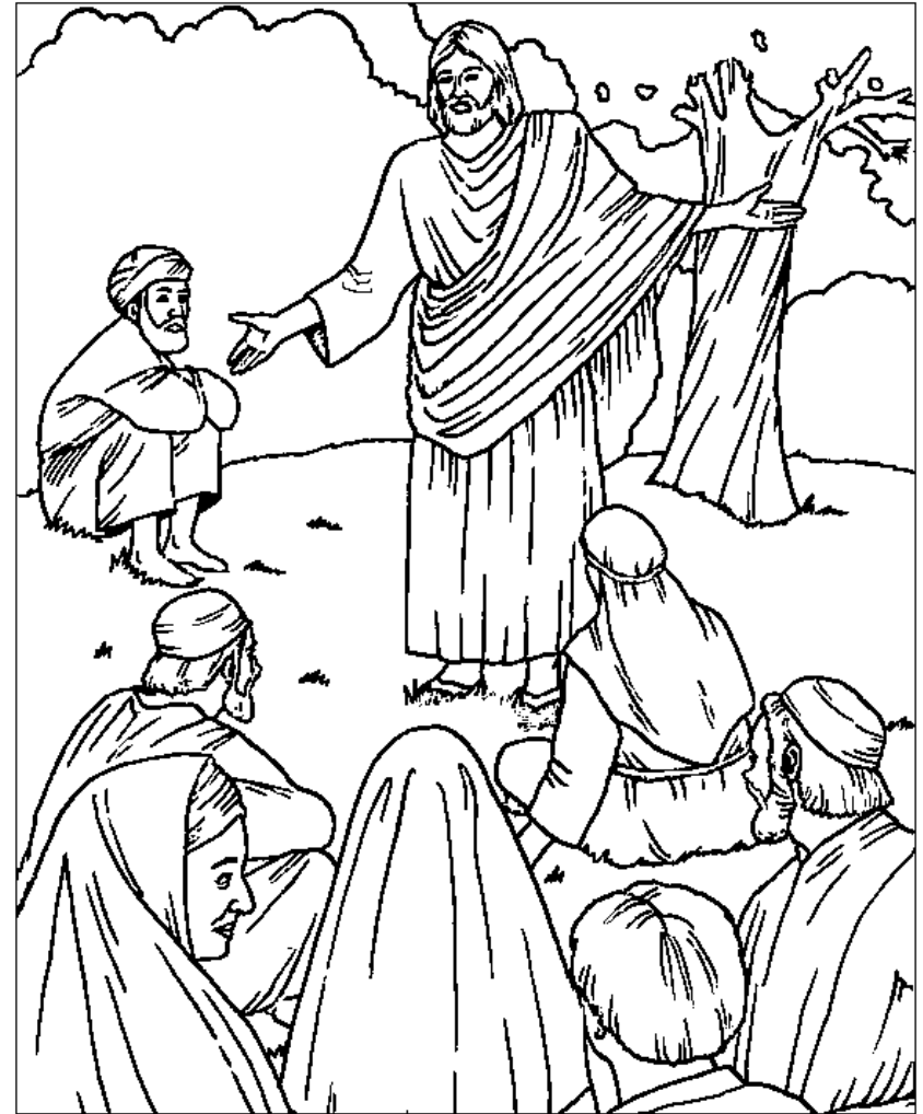
The Sermon on the Mount Matthew 5:1-12