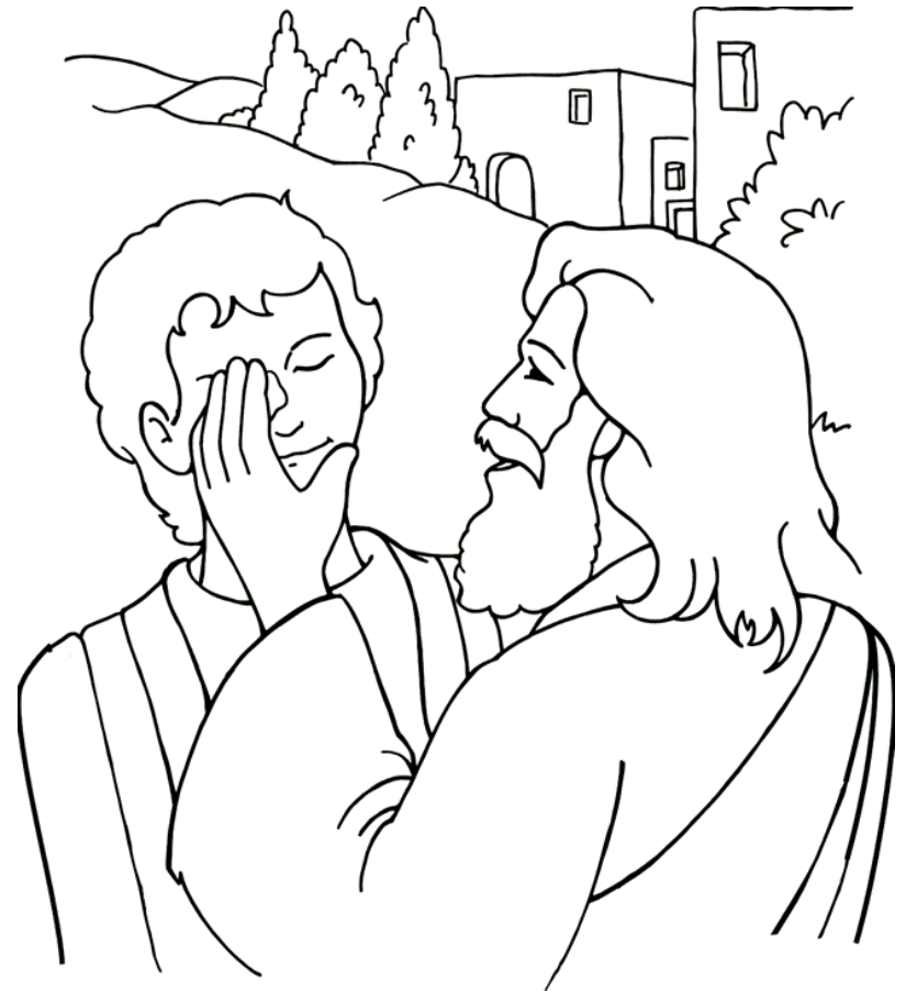
Jesus heals a blind man. John 9

From Thru-the-Bible Coloring Pages for Ages 4-8. © 1986, 1988 Standard Publishing. Used by permission. Reproducible Coloring Books may be purchased from Standard Publishing, www.standardpub.com , 1-800-543-1301.